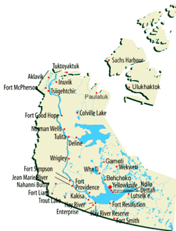
Figure 1 – NTPC Operating Area

Total electrical load is approximately 68 MW with isolated power systems having generating capacities ranging from 65 MW at Snare/Yellowknife to 240 kW at Colville Lake and with the exception of the two small hydro grids these systems are isolated and unconnected, each must be planned for and operated independently.