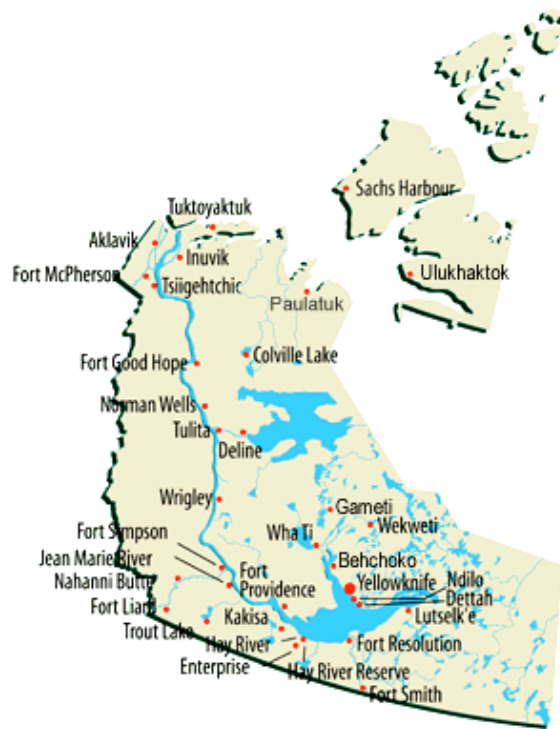
Figure 1 – NTPC Operating Area